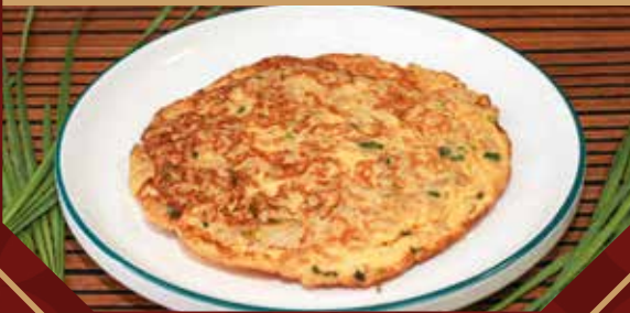
菜脯煎蛋 Pickle Fried Egg