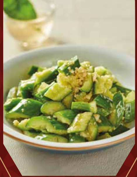
脆爽青瓜 Japanese Cucumber Salad