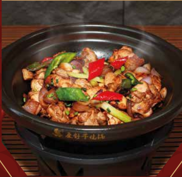
啫啫菜园鸡煲 Jue Jue Farm Chicken