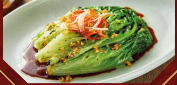
白灼生菜 Poached Iceberg Lettuce