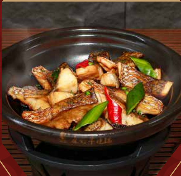
啫啫石甲鱼煲 Jue Jue Seabass