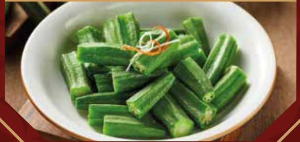
白灼秋葵 Poached Lady's Fingers with Seafood Sauce and Mustard dip