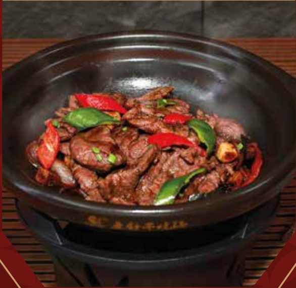
啫啫牛肉煲 Jue Jue Beef