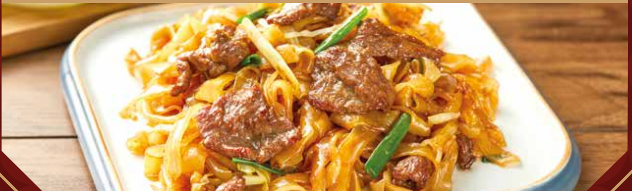
干炒牛肉粿条 Fried Beef Kue Teow