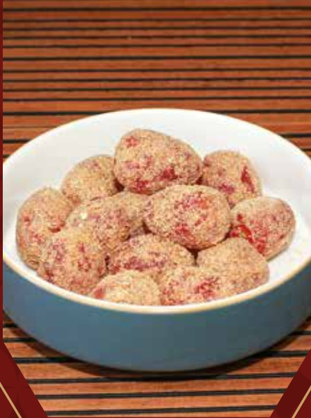
金桔樱桃茄 Kumquat Cherry Tomatoes