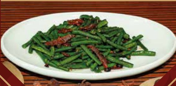
豆豉鲛鱼炒豆角 Stir-fried Long Beans with Fermented Dace Fish