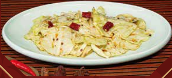
香辣包菜 Spicy Cabbage