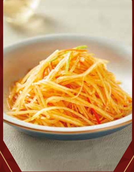
酸辣土豆丝 Tangy Spicy Potato