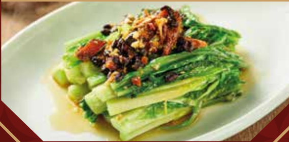
豆豉鲛鱼油麦菜 Stir-fried Romaine Lettuce with Fermented Dace Fish