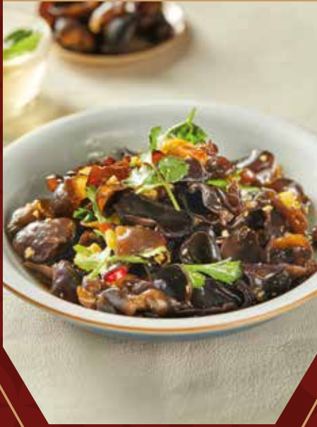
山椒小木耳 Peppery Black Fungus