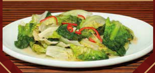
腐乳油麦菜 Stir-fried Romaine Lettuce with Fermented Tofu